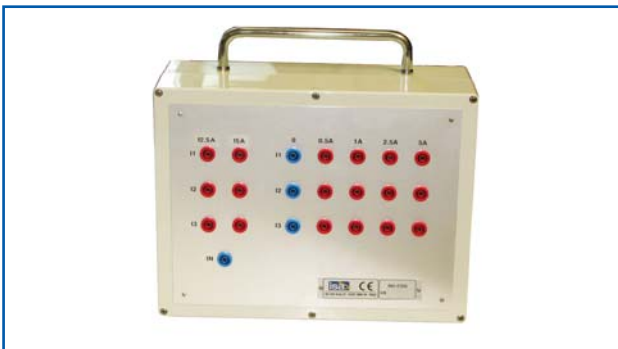
IN 2 CDG - Option for High Burden Relays