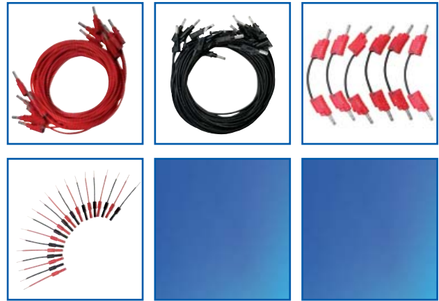
Optional set of testing cables