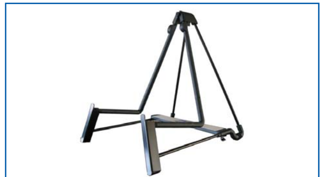
Stand up support