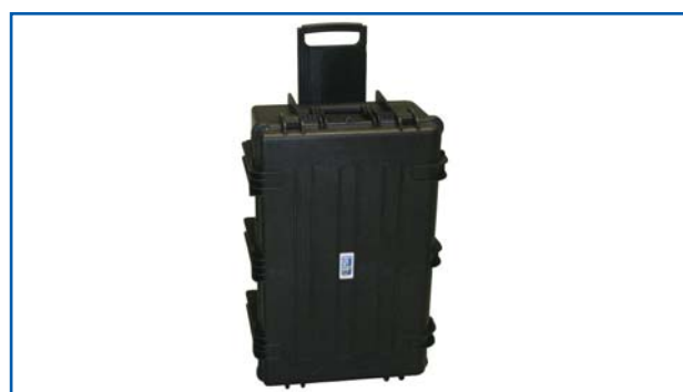
Heavy duty transport case