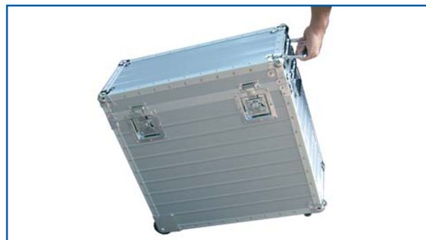
Heavy duty transport case in aluminium