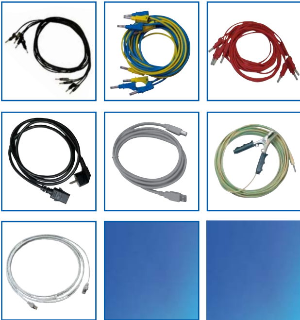
Standard set of testing cables