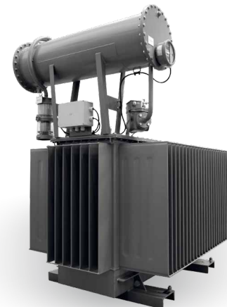
Fig. 2 TKFC 3-phase shunt reactor – corrugated tank with an expansion tank and an air drier