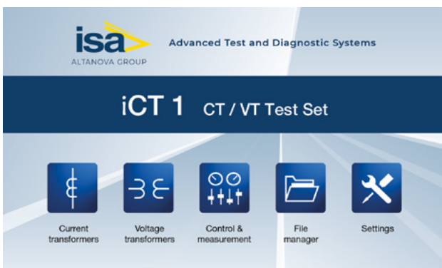
Main Menu Display